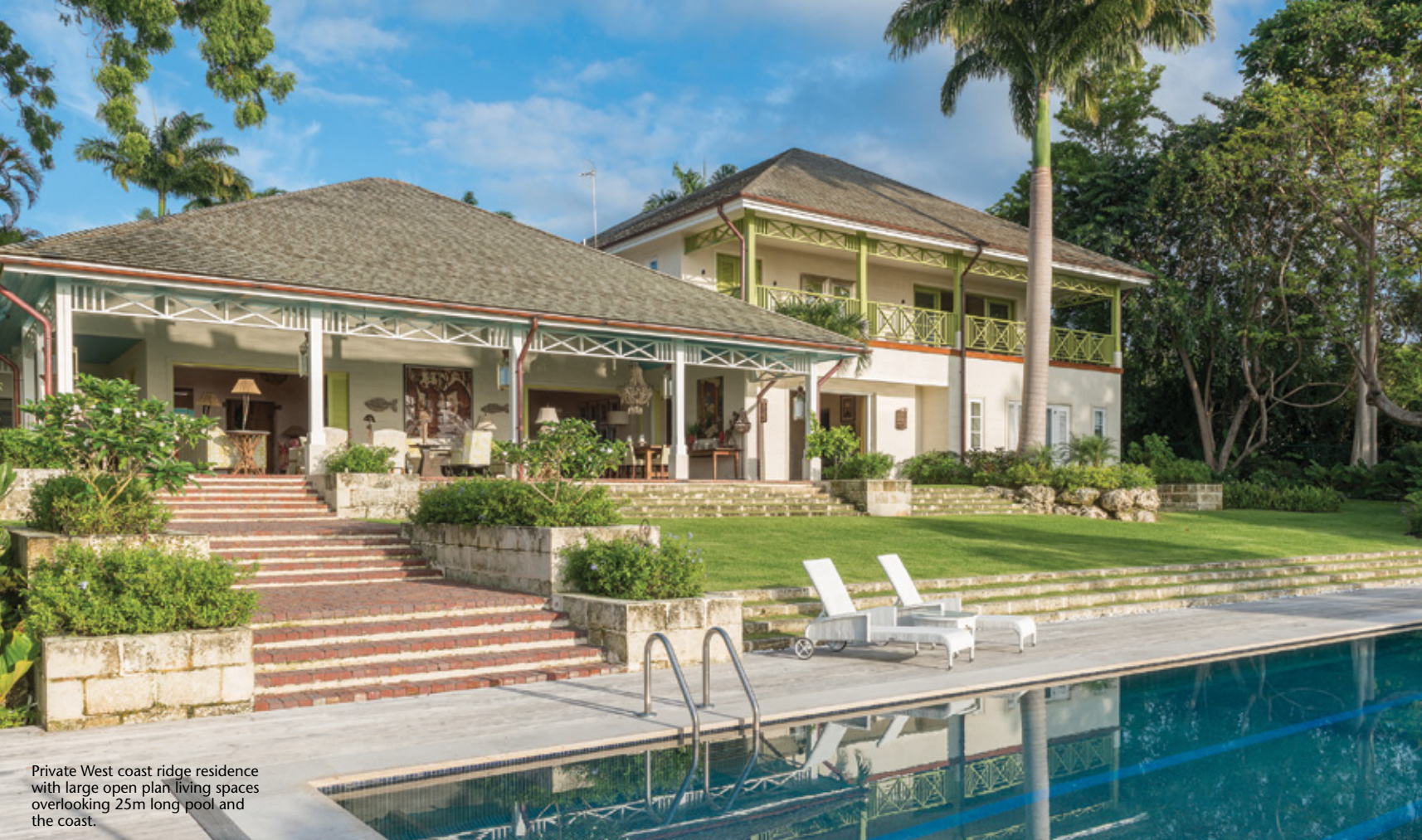
Private West coast ridge residence with large open plan living spaces overlooking 25m long pool and the coast.