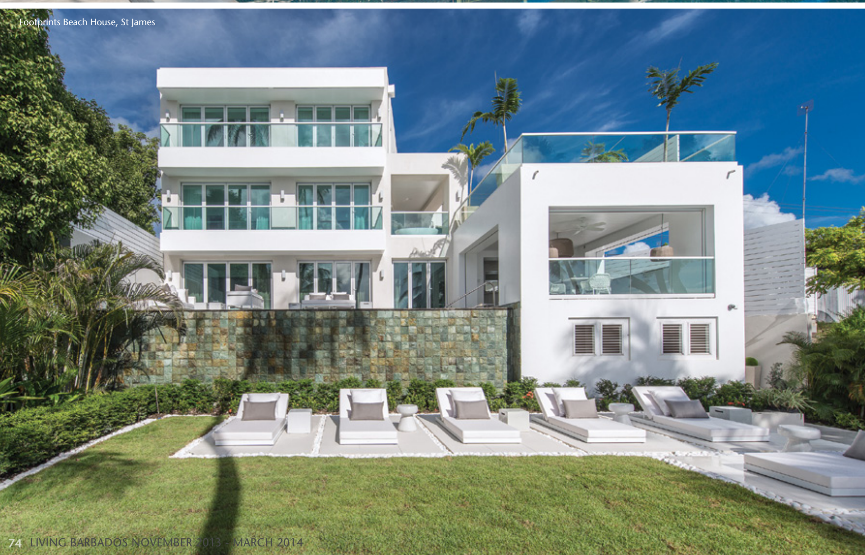
Footprints Beach House, St James