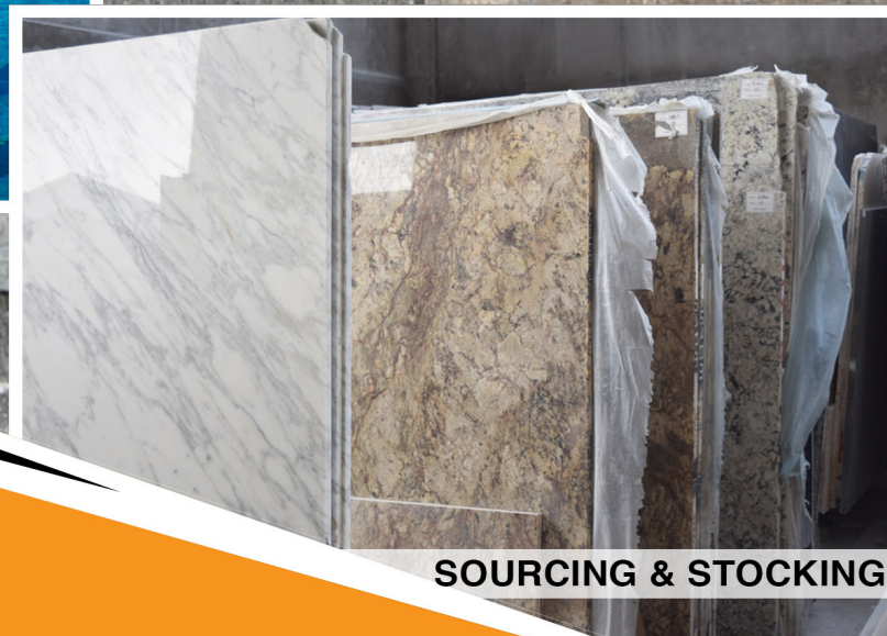
SOURCING & STOCKING

The Company that believes in outstanding customer service